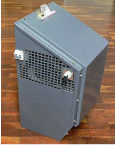
OUTLINE DIMENSIONS (in millimetres):